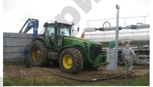
Figure 2. – OrumSemden's "in storage" acidification system at work (farm in Denmark)

These professional equipment can have big influence on farmers interest with large herd size of animals in Poland.