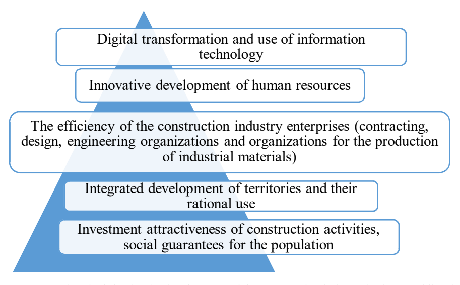
Fig. 1. Basic principles for the development of the construction industry in the Republic of Belarus